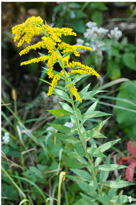
Image 5 below: Solidago canadensis (Canada goldenrod) on top, Solidago missouriensis (Missouri goldenrod) leaf on bottom

Canada goldenrod looks similar to several other species in this genus, so careful identification is important. Usually a large monoculture of yellow flowers in early-fall is a sure sign that you are dealing with Canada goldenrod. They can grow to 3-6'. The leaves are alternate and become slightly smaller towards the apex of the plant, though, unlike some goldenrods, the entire stalk is thoroughly covered by leaves. The margins of the leaves are toothed or smooth with a lanceolate to broadly linear shape to them. White hairs can be found on the stems and the underside of the leaves are pubescent. Multiple flowering stems emerge from the top of the plant with compact heads of tiny yellow flowers which bloom in late summer and fall. The flowering heads are arranged only on the upper part of the stems.